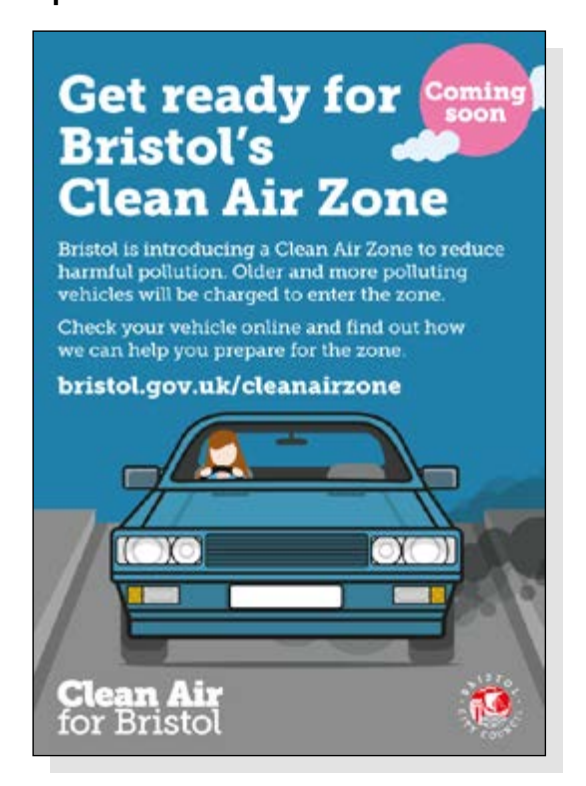
A4 downloadable poster